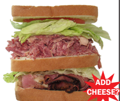
#22 SONNY BOY $15.99 Corned Beef, pastrami, lettuce, tomato, mustard, on triple decker white toast.