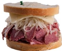
#5 CLASSIFIED $14.99 Corned beef, Swiss, sauerkraut, Russian dressing, on rye.