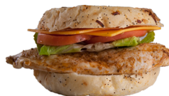
#9 DETROITER $14.99 Grilled chicken, lettuce, tomato, cheddar cheese, ranch, on onion roll.