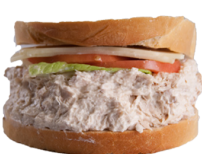
#17 DOWNTOWN $14.99 White Albacore tuna salad, lettuce, tomato, Swiss, on rye.