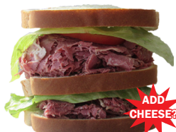
#3 LOCAL $15.99 Corned beef, lettuce, tomato, Russian, on triple decker white toast.