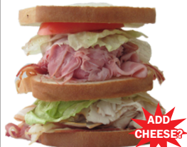
#21 MIA'S CLUB $15.99 Ham, turkey, bacon, lettuce, tomato, mayo, on triple decker white toast.