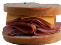
#8 BREAKING NEWS $14.99 Ham, lettuce, tomato, American cheese, mustard, on rye.