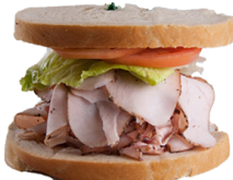
#10 BUSINESS $14.99 Turkey-pastrami, Swiss, lettuce, tomato, mustard, on rye.