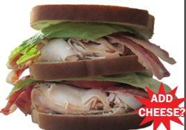
#13 LOLA'S CLUB $15.99 Turkey, bacon, lettuce, tomato, mayo, on triple decker white.