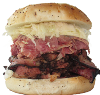
#15 NEWS $14.99 Corned beef, pastrami, coleslaw, Swiss, Russian dressing, on onion roll.