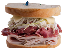
#2 SPORTS $14.99 Corned beef, turkey, cole slaw, Swiss, Russian dressing, on rye.