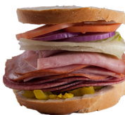
#12 WALLSTREET $14.99 Ham, salami, Swiss, lettuce, tomato, red onion, banana peppers, Italian dressing, on rye.