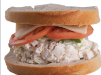
#7 PRESS $14.99 Chicken salad, lettuce, tomato, Swiss, on rye.