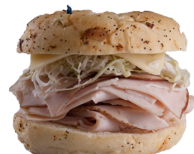
#18 TRAVELER $14.99 Turkey, coleslaw, Swiss, Russian dressing, on onion roll.