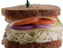
#16 LIFESTYLE $11.99 Swiss, coleslaw, lettuce, tomato, onion, banana pepper, Italian dressing, on wheat toast.