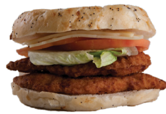
#14 EDITORIAL $14.99 Fried chicken, lettuce, tomato, Swiss, Mayo, on onion roll.

COMBO IT! $2.99 W/ FRIES AND FOUNTAIN DRINK