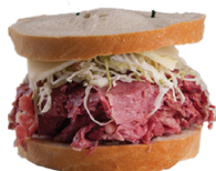
#1 FRONT PAGE $14.99 Corned beef, coleslaw, Swiss, Russian dressing, on rye.

Grilled 50¢ • Extra Cheese 75¢ • Extra Meat $3.00 • Lean $1.00 • Fried Egg $1.00 • Gluten Free Bread $2.50 All sandwiches are available in Jr. size