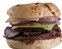
#11 METRO $14.99 Roast Beef, lettuce, tomato, onion, Swiss, Italian dressing, on onion roll.