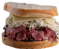
#6 WEATHER $14.99 Pastrami, cole slaw, Swiss, Russian dressing, on rye.