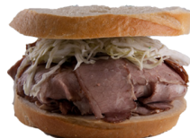
#20 AUTHORITY $14.99 Beef brisket, coleslaw, Swiss, Russian dressing, on rye.