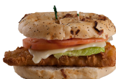
#19 WEEKEND $14.99 Deep fried cod, lettuce, tomato, American cheese, tarter sauce, on onion roll.