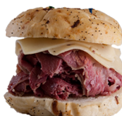
#4 HEADLINER $14.99 Corned beef, Swiss, mustard, on onion roll.